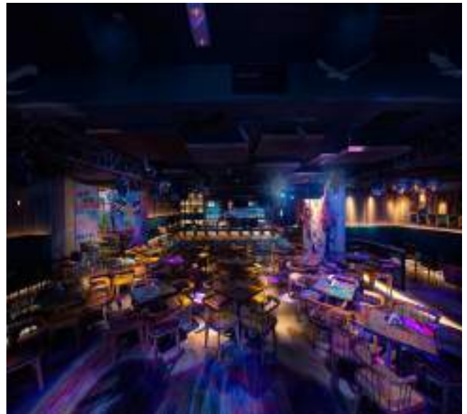
PINOY RESTAURANT (ARCHITECT OF RECORD) | Hyatt Place