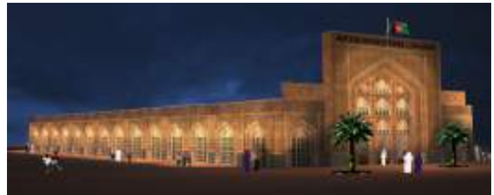
AFGHANISTAN PAVILION (PROPOSAL) | Global Village 2014