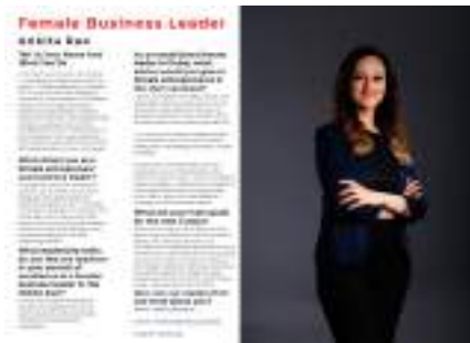
BIZPRENEUR | October 2021