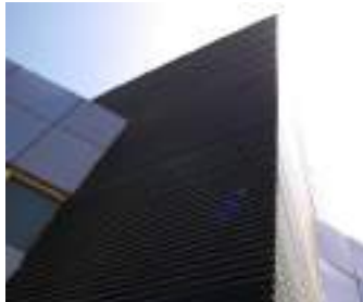
AL SAKR | Jebel Ali Free Zone