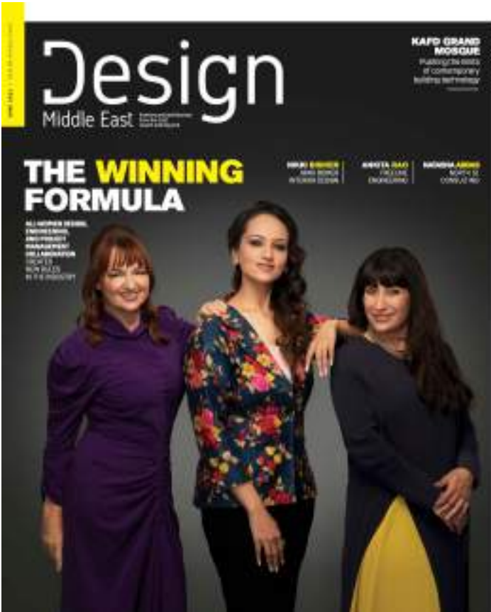
COVER FEATURE & STORY | June 2021