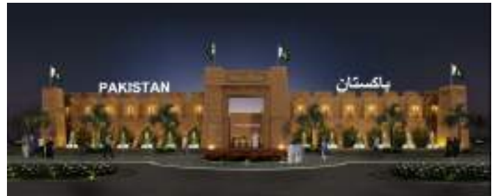
PAKISTAN PAVILION | Global Village 2015