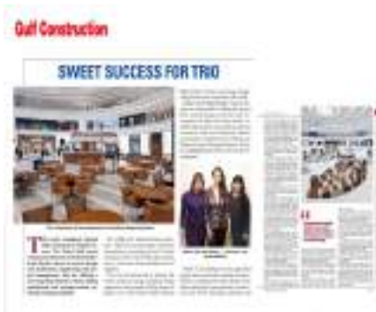
GULF CONSTRUCTION | July 2021