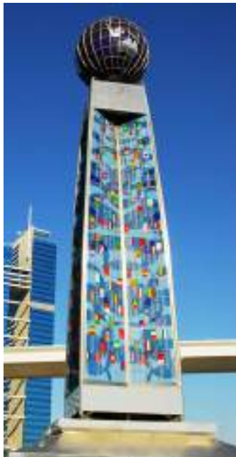
IMF MONUMENT | Trade Centre

Global Village Expo 2020 Burj Downtown Al Serkal Avenue Al Quoz Trade Centre Dubai Investment Park Warsam Al Qusais Dubai Media City Oud Metha