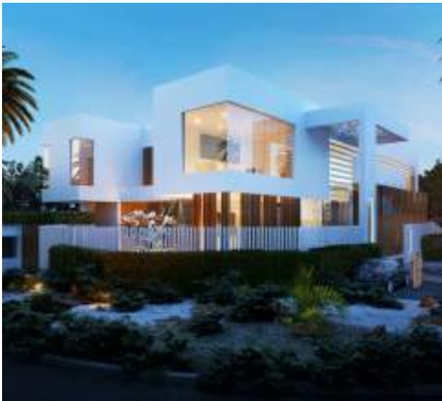
PRIVATE VILLA | Jumeirah