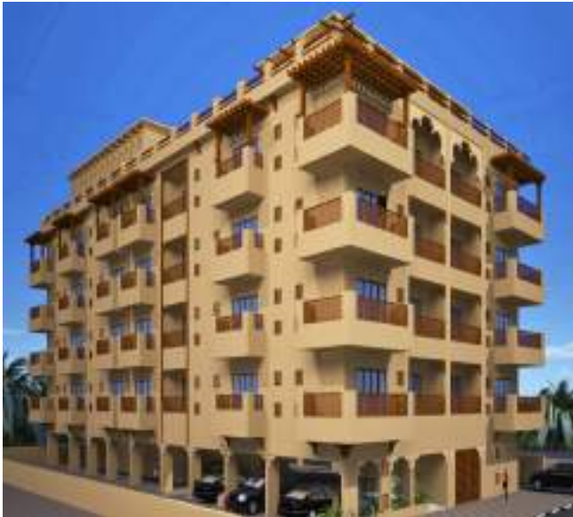
G + 4 BUILDING | Al Warqaa