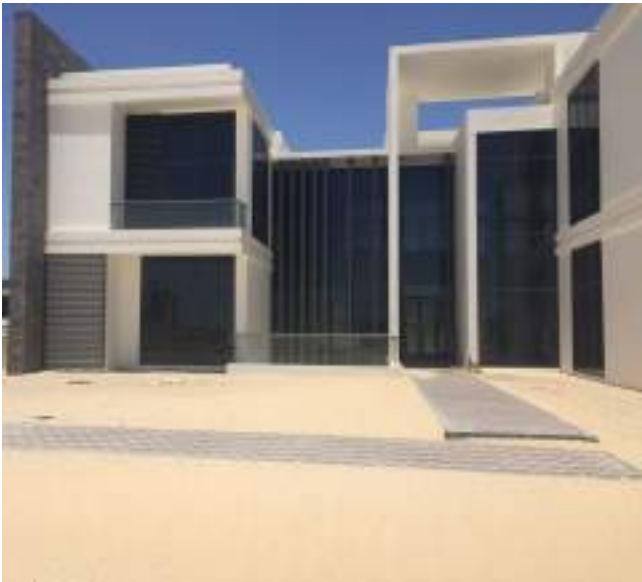
PRIVATE VILLA (SHELL & CORE) | Dubai Hills