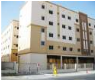
UNIBEATON | Dubai Investment Park

Angola, Africa Jebel Ali Industrial Dubai Investment Park Dubai Industrial City Al Quoz Industrial Muhaisanah Ajman Industrial Al Quoz Al Layan