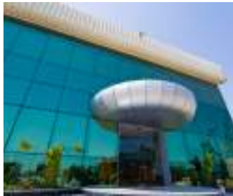
CONTINENTAL | Jebel Ali Free Zone

Dubai Industrial City (DIC) Techno Park Jebel Ali Free Zone (JAFZA) Dubai Investment Park (DIP) Al Quoz Industrial Ras Al Khor Industrial Al Qusais DP World Ataay Jebel Ali Industrial