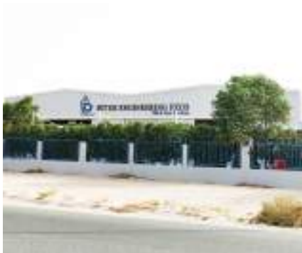
HITEK ENGINEERING | Techno Park