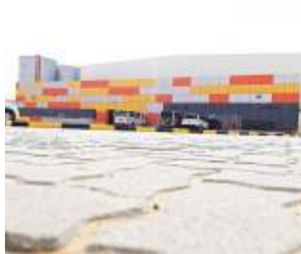
SKYWAY | Jebel Ali Free Zone