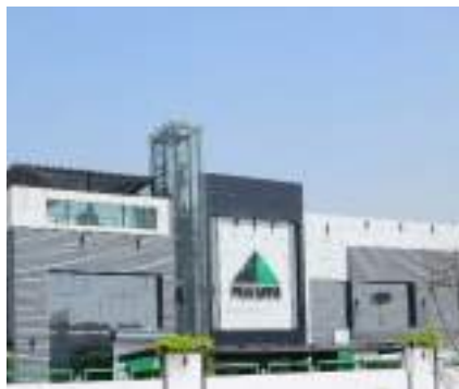
PRAVARTHI FIRE | Jebel Ali Free Zone