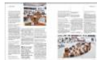
COVER FEATURE & STORY | October 2021