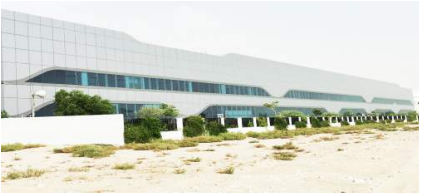
INTERIORS INTERNATIONAL | Techno Park