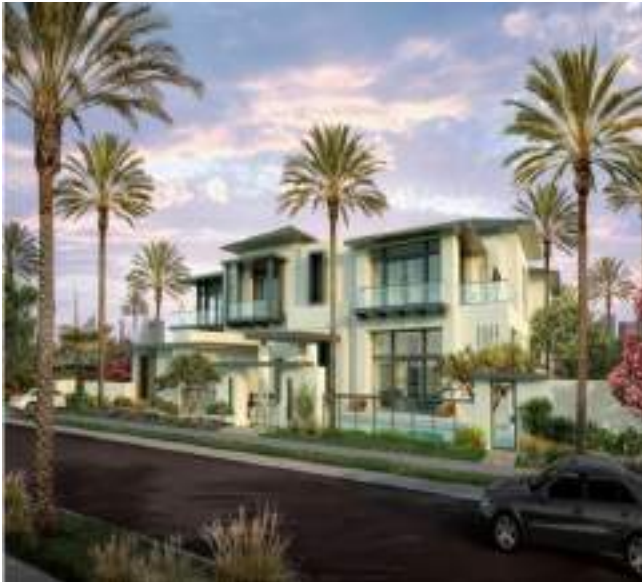
PRIVATE VILLA (ARCHITECT OF RECORD) | Dubai Hills