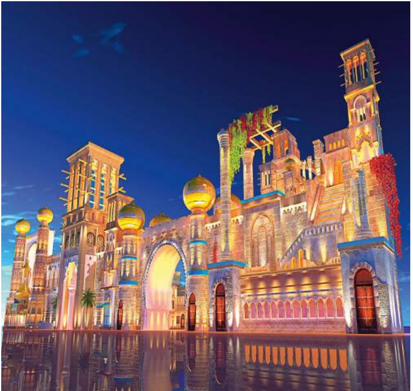
STRUCTURAL CONSULTANCY (ALL PAVILIONS) | Global Village 2010 - 2013