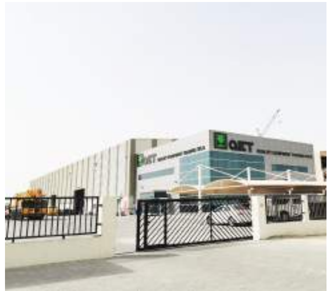
QUALITY EQUIPMENT TRADING | Jebel Ali Free Zone