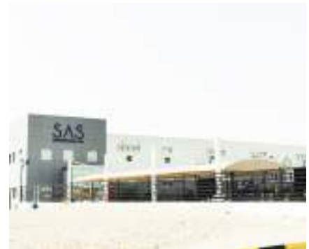
SAS INTERNATIONAL | Techno Park