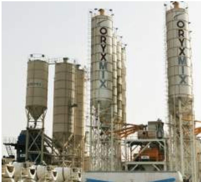
ORYX MIX READY MIX | Dubai Industrial City