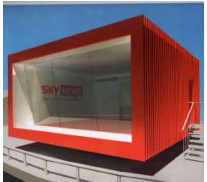
SKY NEWS BROADCAST BOOTH | Dubai Media City