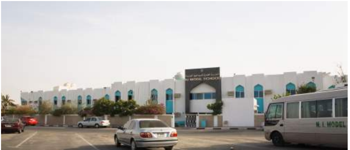
N I MODEL SCHOOL EXTENSION | Al Garhoud