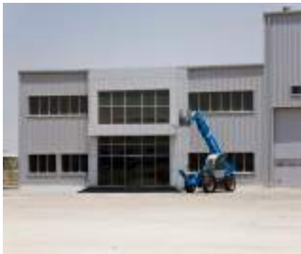
AAA CONSTRUCTIONS | Jebel Ali Free Zone