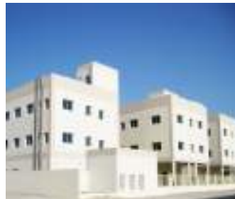
DANWAY | Dubai Investment Park