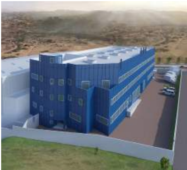
SHALINA HEALTHCARE | Angola , Africa