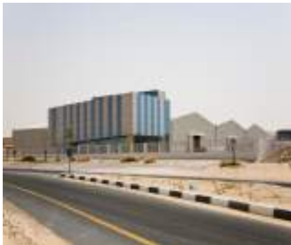
UNIGRAPH | Dubai Investment Park