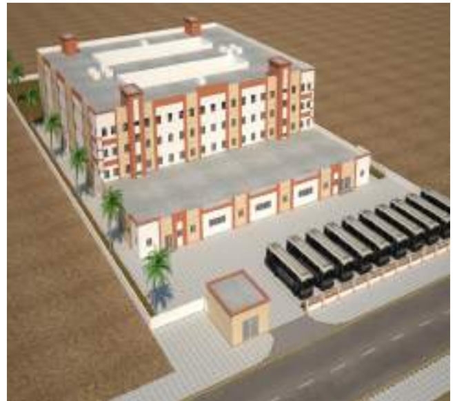
JSCOM CONTRACTING | Dubai Industrial City