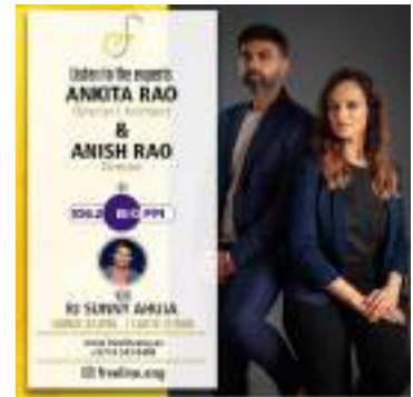
RADIO INTERVIEW | April 2021