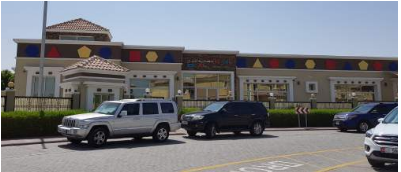
IDEA EARLY LEARNING CENTRE | Victory Heights