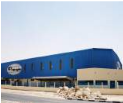
TAD LOGISTICS | Jebel Ali Free Zone