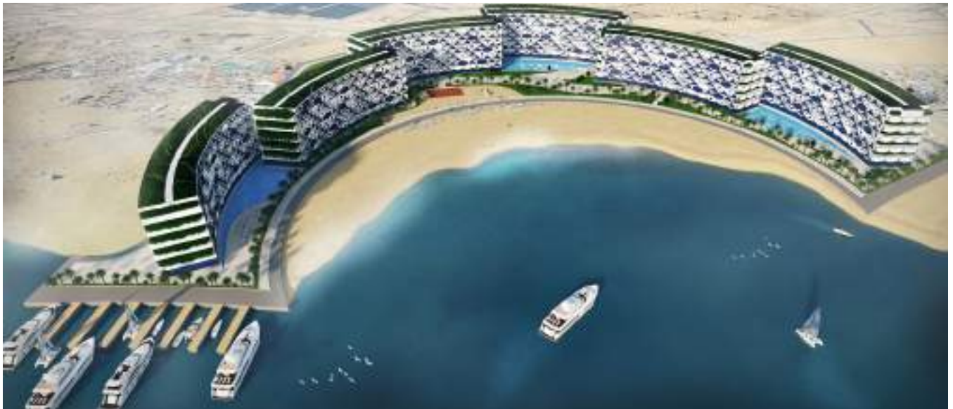
LUXURY G+10 HOTEL (PROPOSAL) | Ras Al Khaimah