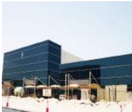
BELTEXCO LIMITED | Jebel Ali Free Zone