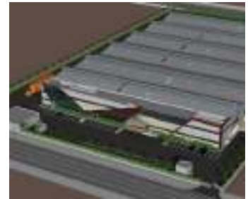
ROYAL UNITED | Dubai Industrial City