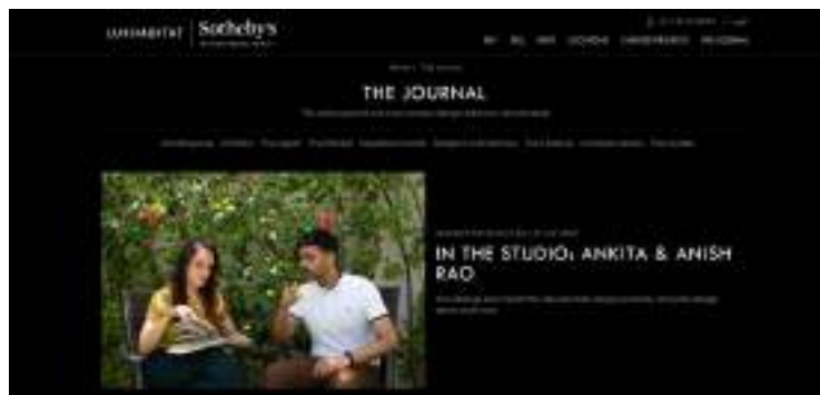
LUXHABITAT BY SOTHEYB'S | June 2021