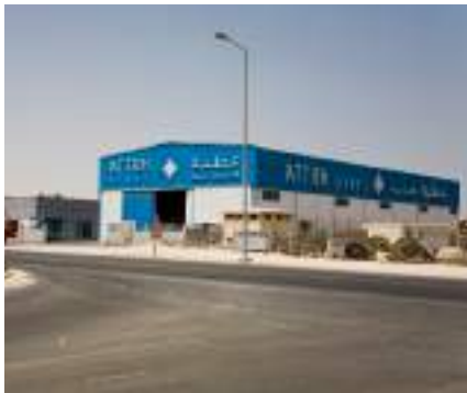
ATTEIH STEEL | Jebel Ali Free Zone