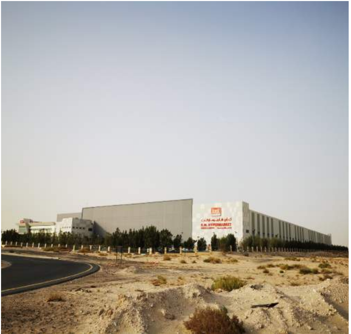
KM TRADING | Dubai Industrial City