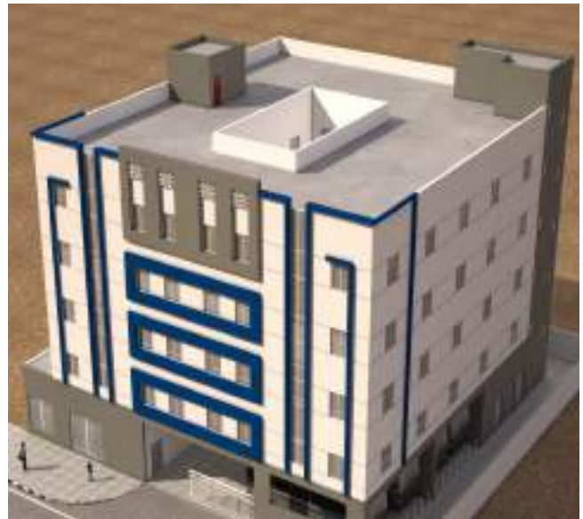
Jebel Ali Industrial