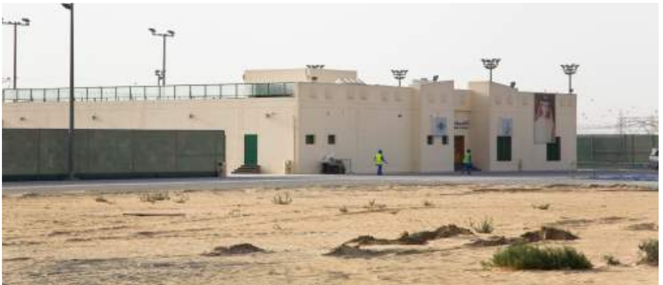
TENNIS TRAINING ACADEMY | Mirdiff