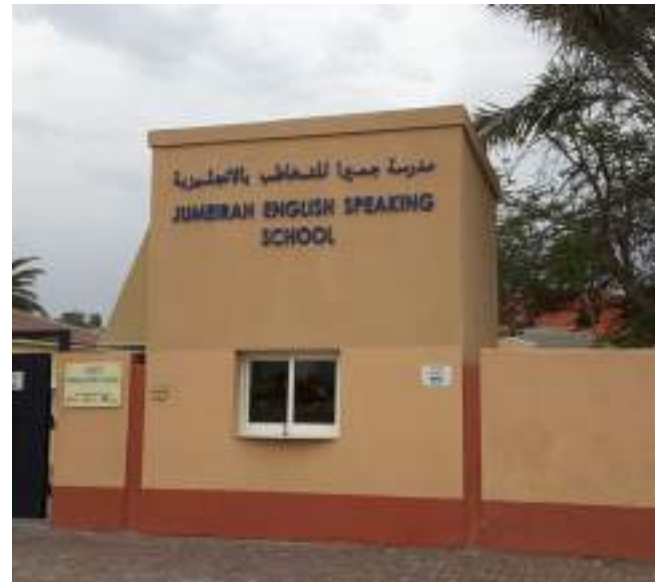
JUMEIRAH ENGLISH SPEAKING SCHOOL EXTENSION | Al Safa