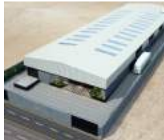
SWATI FURNITURE | Techno Park