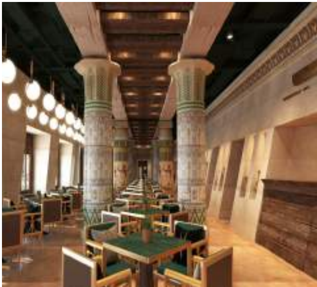
KHOFO RESTAURANT (ARCHITECT OF RECORD) | Marsa Al Seef