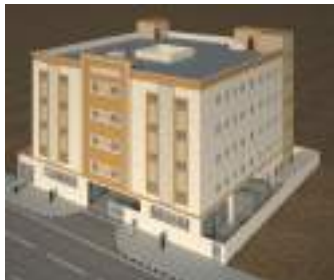
BDGM | Jebel Ali Industrial