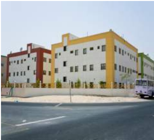
EUROSTAR INTERNATIONAL | Dubai Investment Park