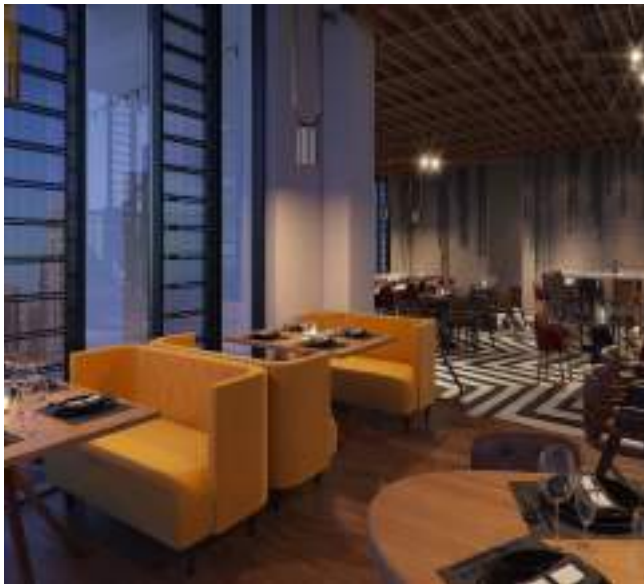
SILVER BEACH CAFE (ARCHITECT OF RECORD) | Marsa Al Seef