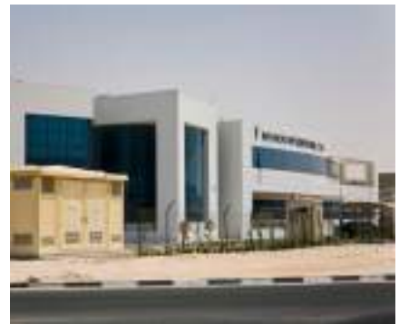
INTERIORS INTERNATIONAL | Jebel Ali Free Zone