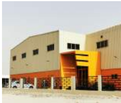
FOUR SEASONS R. G. | Techno Park