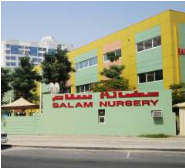
SALAAM NURSERY | Al Nahda