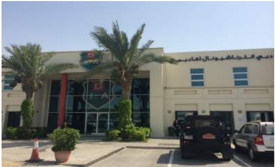
DIA SCHOOL EXTENSION | Emirates Hills

Emirates Hills Mirdiff Burj Dubai Al Quoz Al Barsha Victory Heights Jumeirah Village Circle Al Garhoud Al Nahda Al Safa