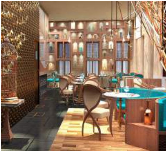
MITRA RESTAURANT (ARCHITECT OF RECORD) | Marsa Al Seef