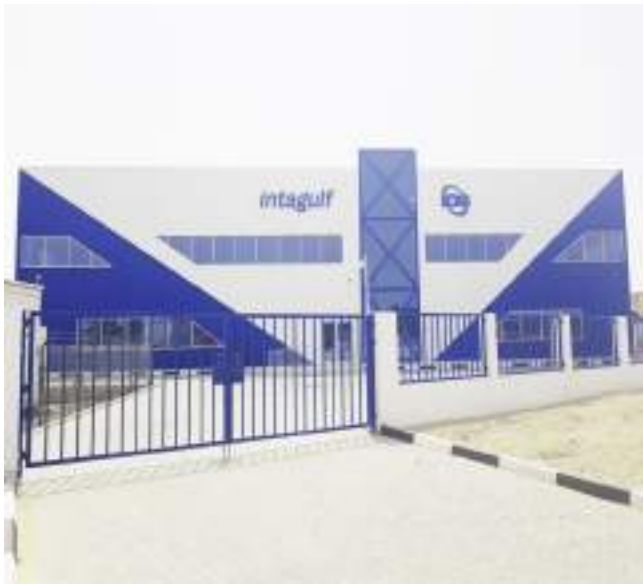
INTAGULF | Jebel Ali Free Zone