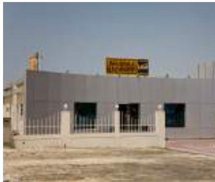
UNIVERSAL MACHINERY | Jebel Ali Free Zone