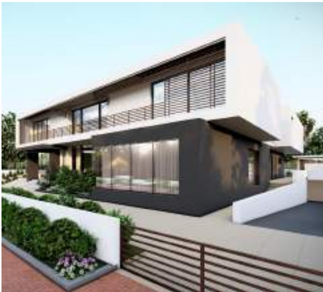
PRIVATE VILLA | District 1 Meydan