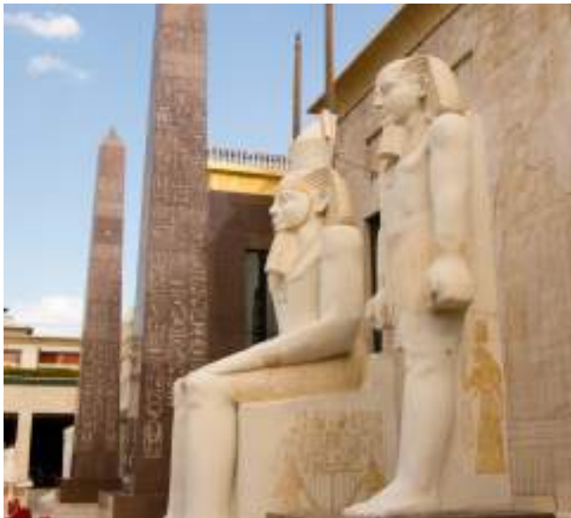
WAFI PHAROH'S STRUCTURAL DESIGN | Oud Metha