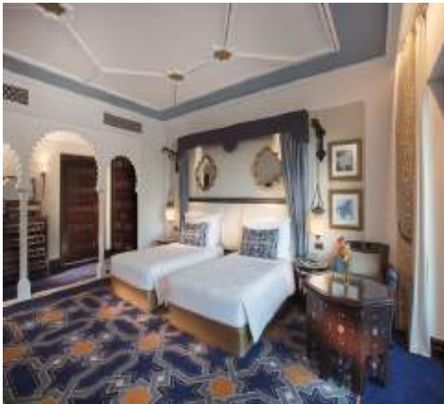
AL QASR HOTEL REFURBISHMENT (ARCHITECT OF RECORD) | Jumeirah