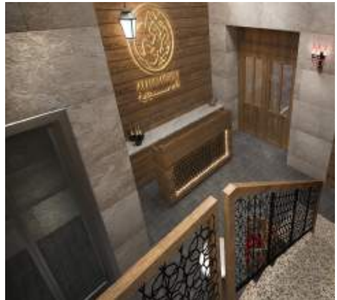
AL HAMIDIEH RESTAURANT (ARCHITECT OF RECORD) | Marsa Al Seef