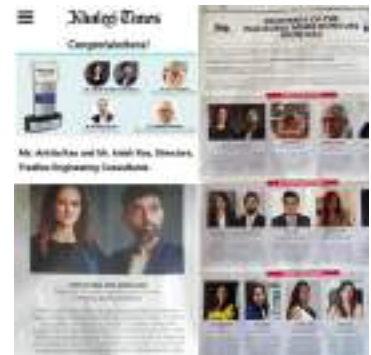
KHALEEJ TIMES | July 2021