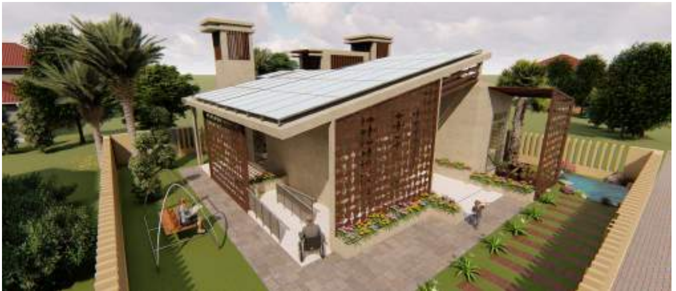
DEWA NET ZERO ENERGY HOUSE PROTOTYPE (PROPOSAL) | Expo 2020