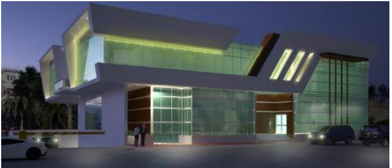
COMMERCIAL BUILDING | Sheikh Zayed Road