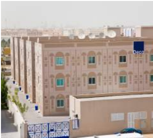
ROBUST CONTRACTING | Dubai Investment Park