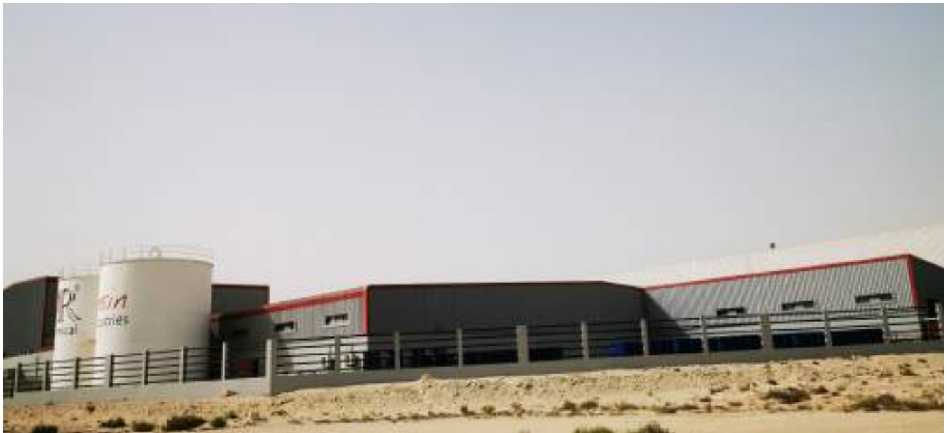
RAR CHEMICALS | Techno Park