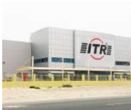
ITR | Jebel Ali Free Zone