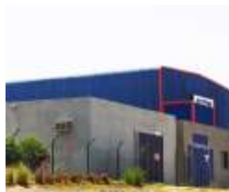
ALSTOM | Jebel Ali Free Zone