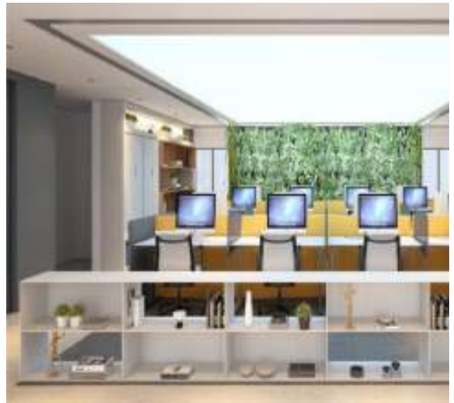
SOLAR TURBINES OFFICE (ARCHITECT OF RECORD) | Jebel Ali Free Zone