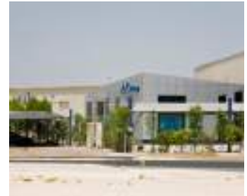
NETCOM | Jebel Ali Free Zone