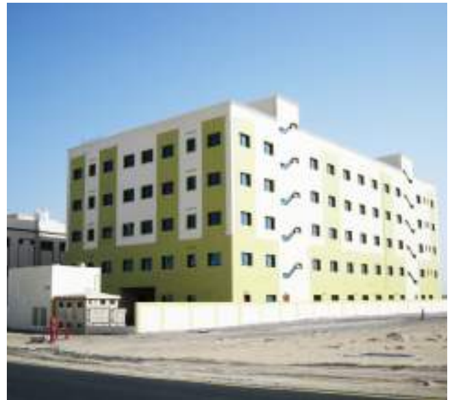
AL BAYAN | Dubai Investment Park