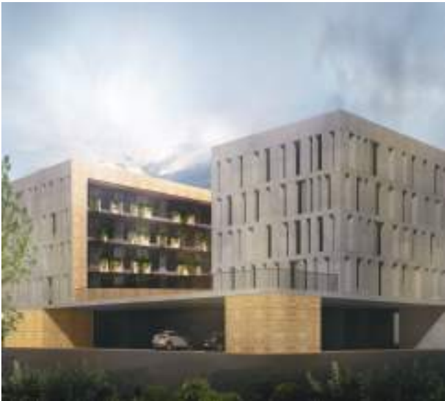
G + 4 BUILDING (PROPOSAL) | Jumeirah Village Circle