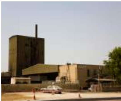
DUCAST FOUNDRY | Al Quoz Industrial