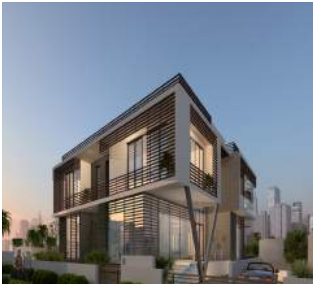
PRIVATE VILLA | District 1 Meydan