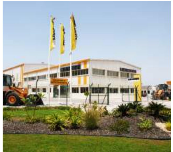
LIEBHERR MIDDLE EAST | Jebel Ali Free Zone