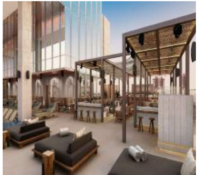
RESTAURANT OF TAJ (ARCHITECT OF RECORD) | Jumeirah Lake Towers