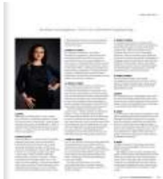
COMMERCIAL INTERIOR DESIGN | August 2021