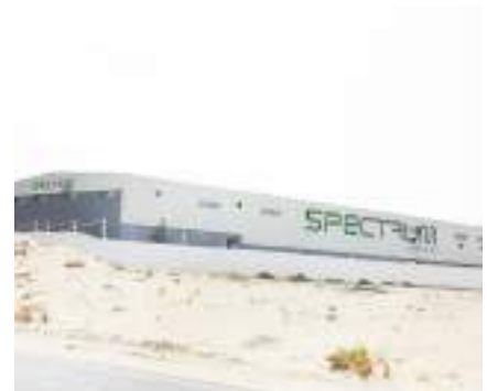
SPECTRUM EXHIBITIONS | Techno Park