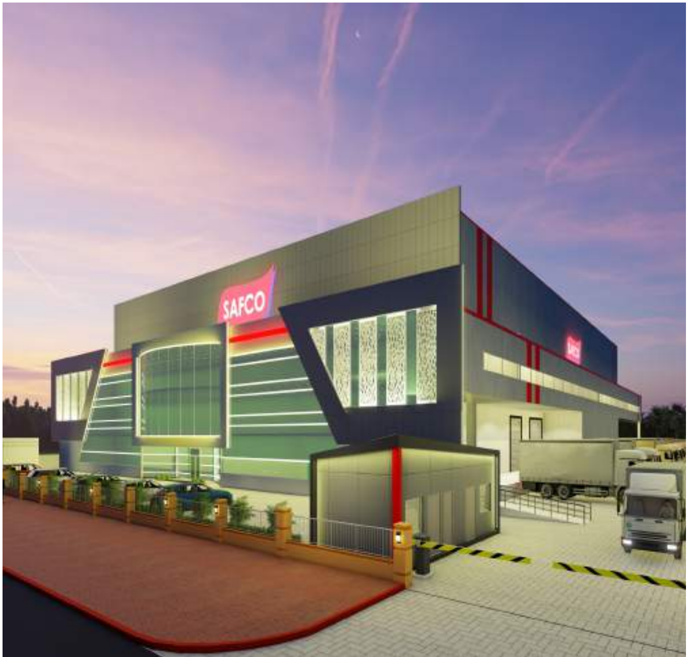
SAFCO | Dubai Industrial City