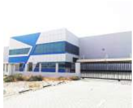
SUMA BLDG MATERIALS | Jebel Ali Free Zone