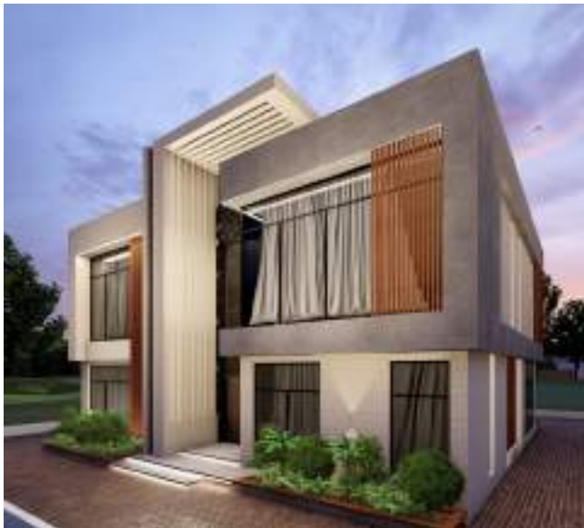
PRIVATE VILLA | Dubai Hills