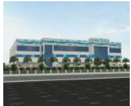
ASMAAK | Dubai Industrial City