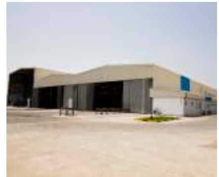
NASH | Jebel Ali Free Zone