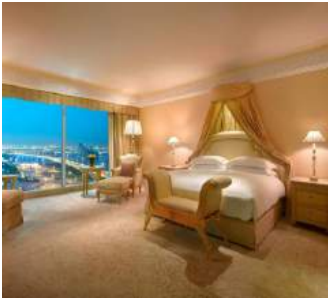
GRAND HYATT REFURBISHMENT (ARCHITECT OF RECORD) | Oud Metha