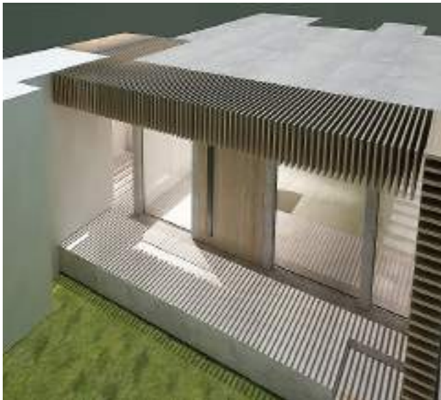
PURITY SHOWROOM | Jumeirah