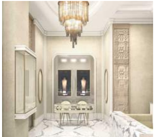
INTERMIX JEWELS (ARCHITECT OF RECORD) | Nakheel Mall