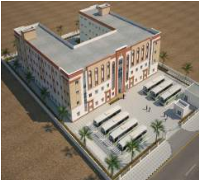
AL JAZAIRI READYMIX JAMIX | Dubai Industrial City