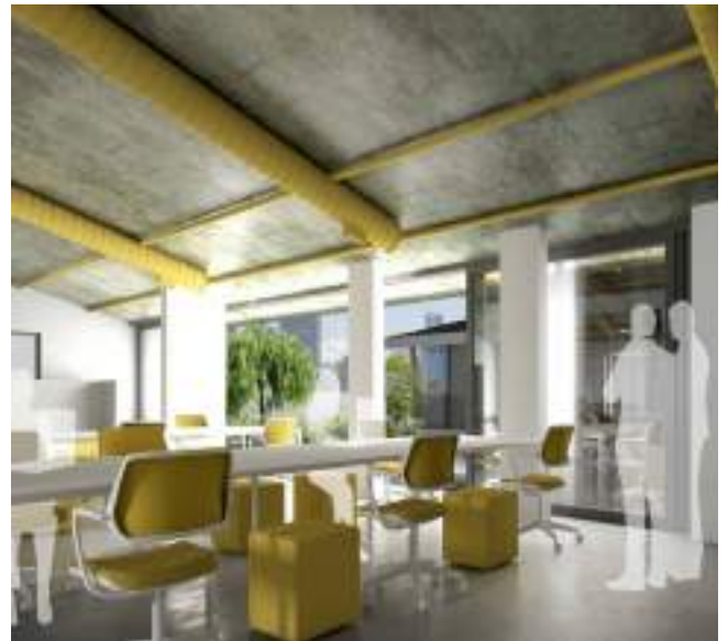
DUBAI REAL ESTATE OFFICE (ARCHITECT OF RECORD) | Jumeirah