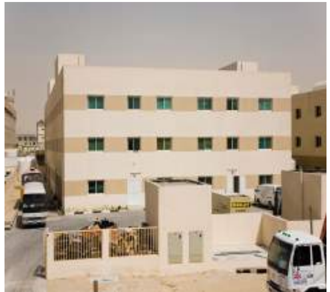
EMIRATES INVESTMENT | Dubai Investment Park