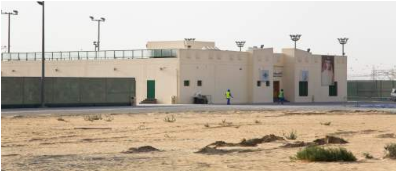
TENNIS TRAINING ACADEMY | Mirdiff