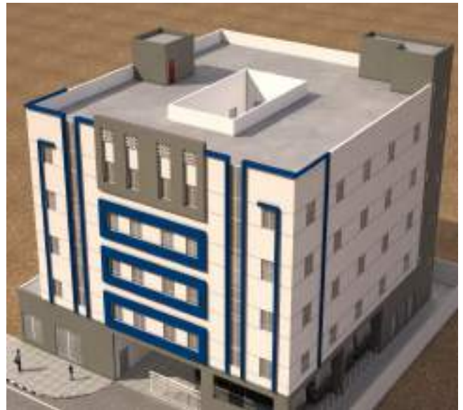
AL BAYAN | Jebel Ali Industrial