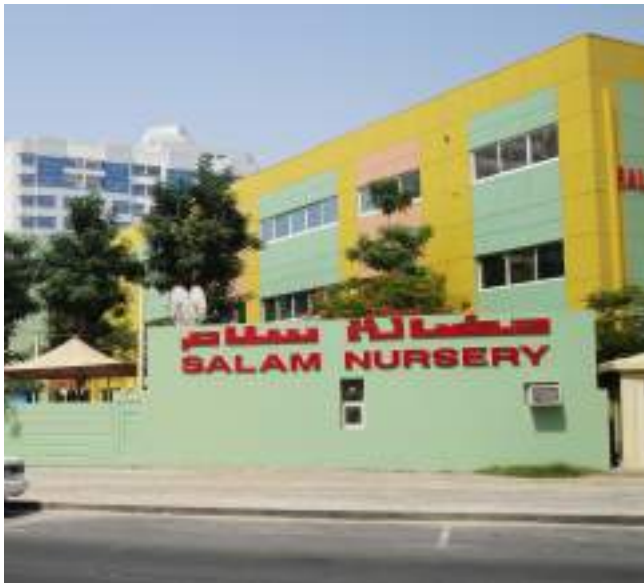
SALAAM NURSERY | Al Nahda