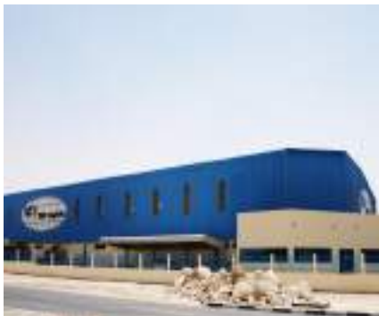
TAD LOGISTICS | Jebel Ali Free Zone