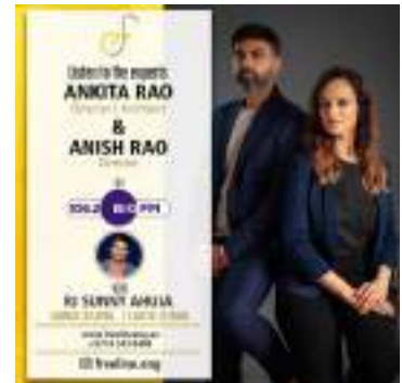
RADIO INTERVIEW | April 2021