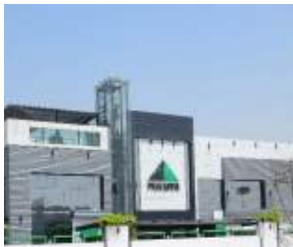
PRAVARTHI FIRE | Jebel Ali Free Zone